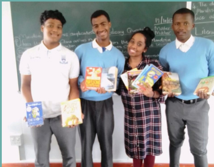
Book delivery to David Livingstone High School