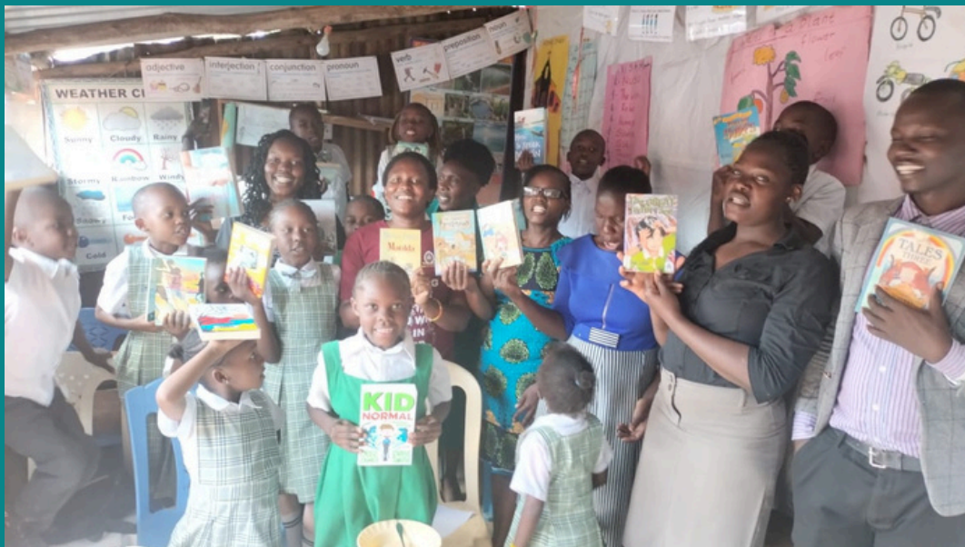
Little Lions School in Kibera, Nairobi